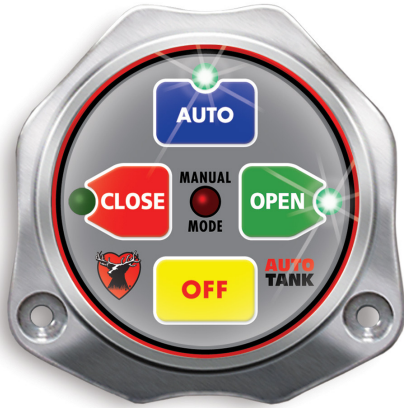
AUTO TANK Control Module